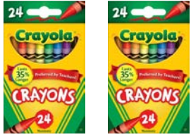
2 CRAYOLA 24 count crayons