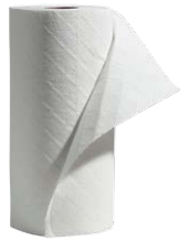
2 Paper towels