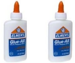
2 Elmer's glue sticks/bottles