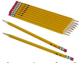
2 packs of #2 pencils