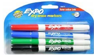
1 pk dry erase markers