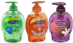
3 hand soap