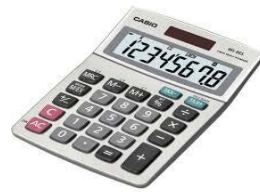
1 calculator-- (Dollar Tree)