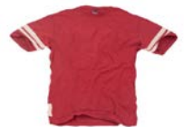
Change of clothes if needed/ diapers/ wipes